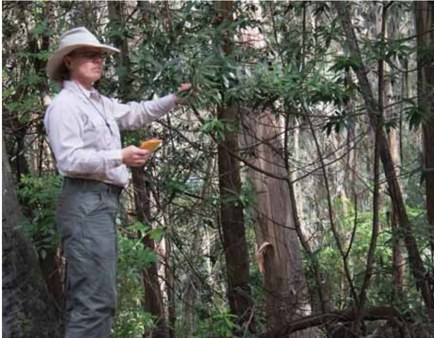
Local trees were inspected during Sudden Oak Death Blitz.